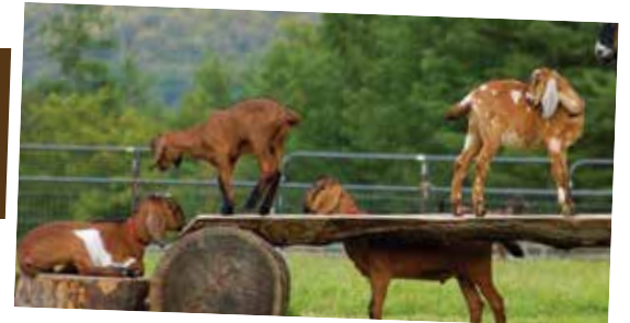
Caption for this photo caption caption.

Farm visits are promoted by DigInVT, a consortium of agriculture and tourism organizations making up the Vermont Agriculture and Culinary Tourism Council.