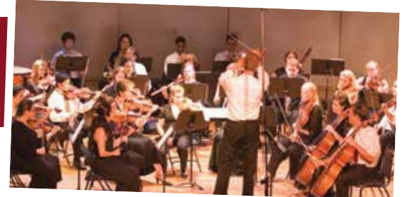
Caption for this photo caption caption.

Arts opportunities come by way of the Vermont Arts Council and Vermont Crafts Council.