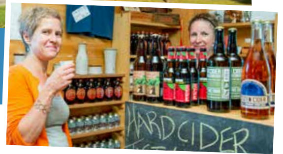
Caption for this photo caption caption

Here's your chance to sample Vermont-grown food and drink by visiting restaurants, lodgings, shops, markets, distilleries, wineries and breweries. Restaurants are members of the Vermont Fresh Network, a network of chefs, farmers, food artisans, and diners and food producers that support Vermont agriculture.